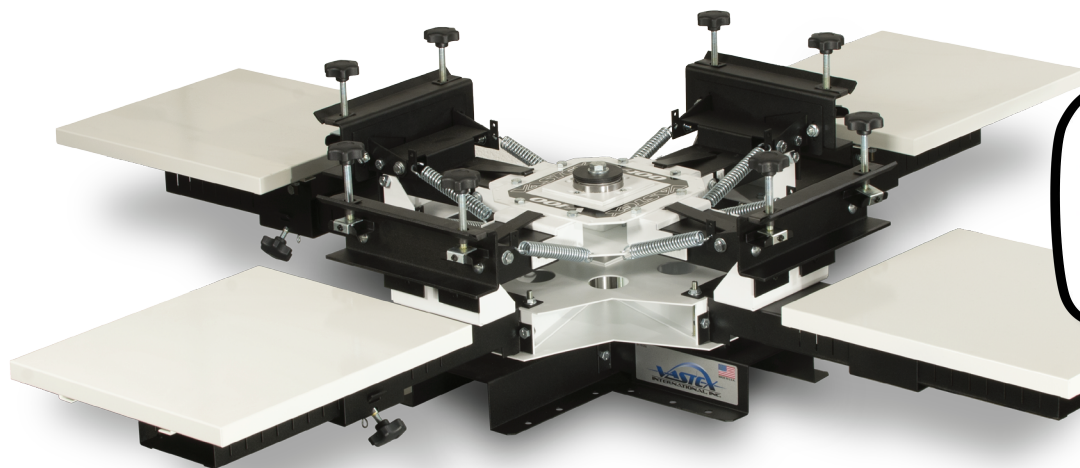
V100-44 4 Station/4 Color Tabletop Press*