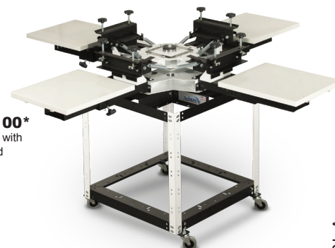
V100-44* w/ S-100* 4 station, 4 color shown with optional S-100 stand

* Press comes unassembled with easy step by step assembly instructions.