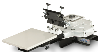
V100-11 1 Station/1 Color Tabletop Press*